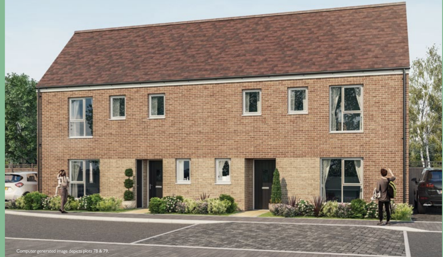
Computer generated image depicts plots 78 & 79.