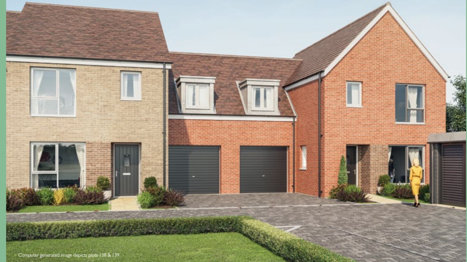
Computer generated image depicts plots 138 & 139.

PLOTS 53, 63, 64, 66-77, 111, 112, 115-118, 138 & 139