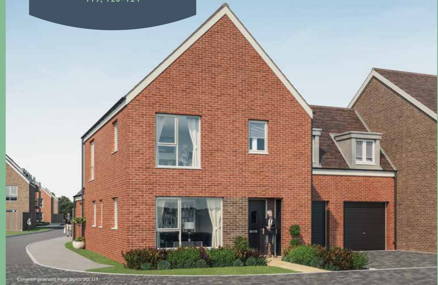
Computer generated image depicts plot 119.