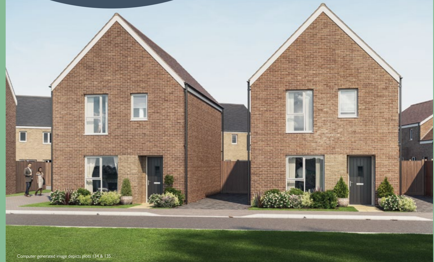
Computer generated image depicts plots 134 & 135.

PLOTS 55, 56, 58-62, 65, 81-84, 88, 94, 108-110, 113, 125, 126, 134-137