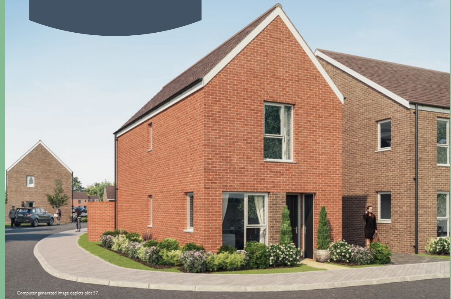
Computer generated image depicts plot 57.