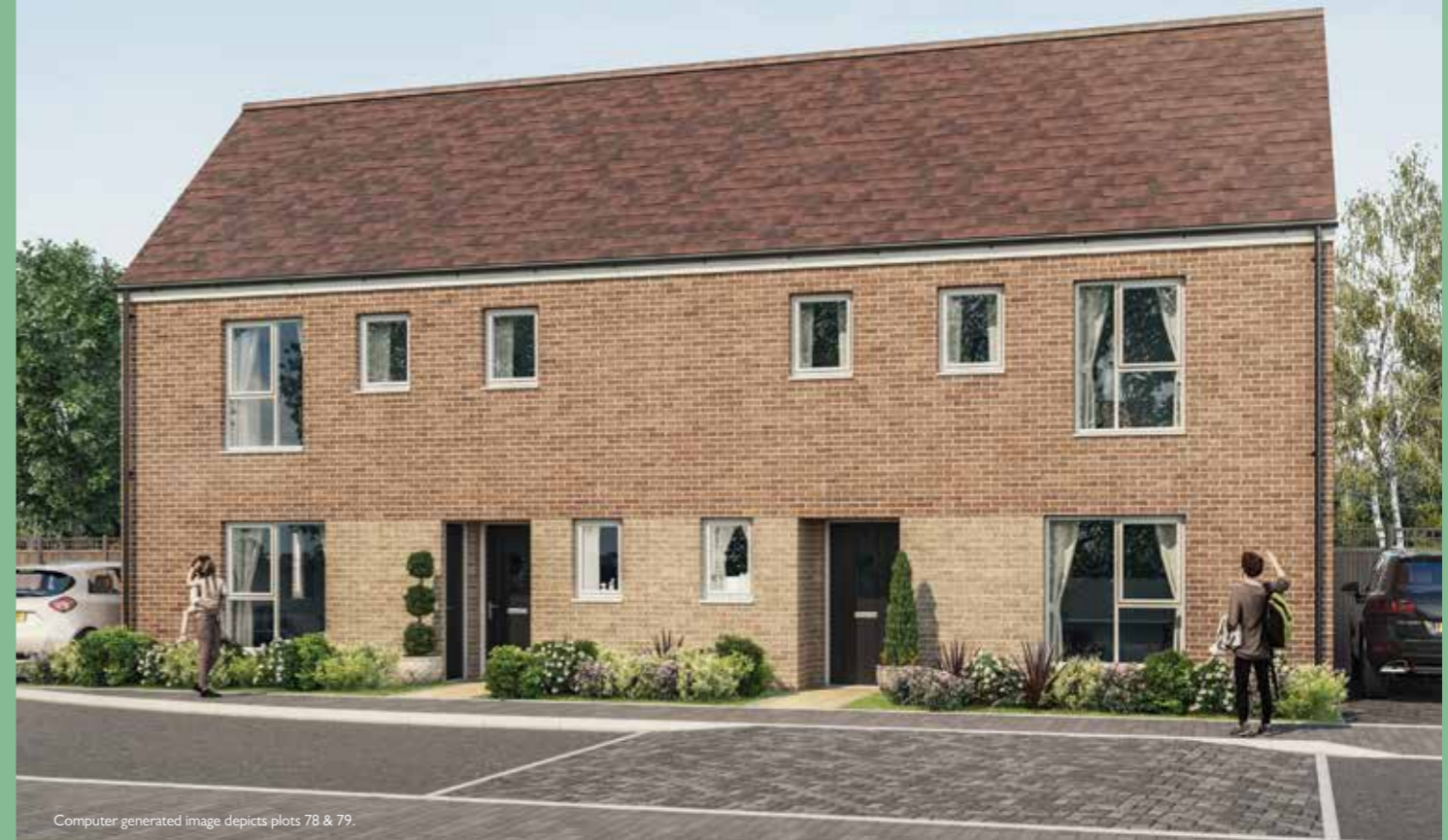
Computer generated image depicts plots 78 & 79.