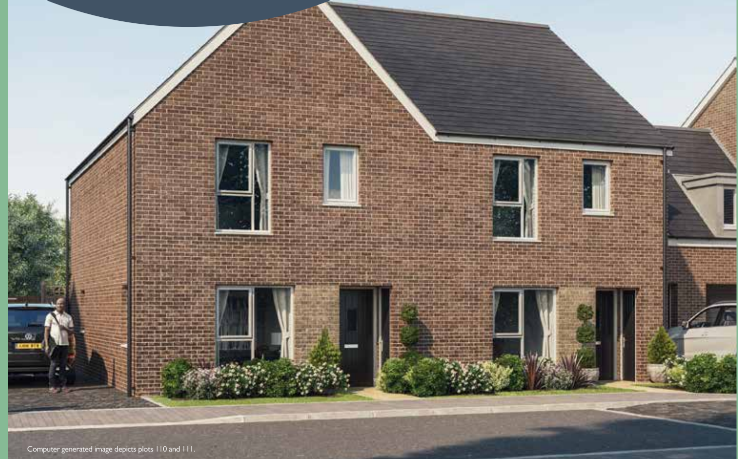
Computer generated image depicts plots 110 and 111.

PLOTS 55, 56, 58-62, 65, 81-84, 88, 94, 108-110, 113, 125, 126, 134-137