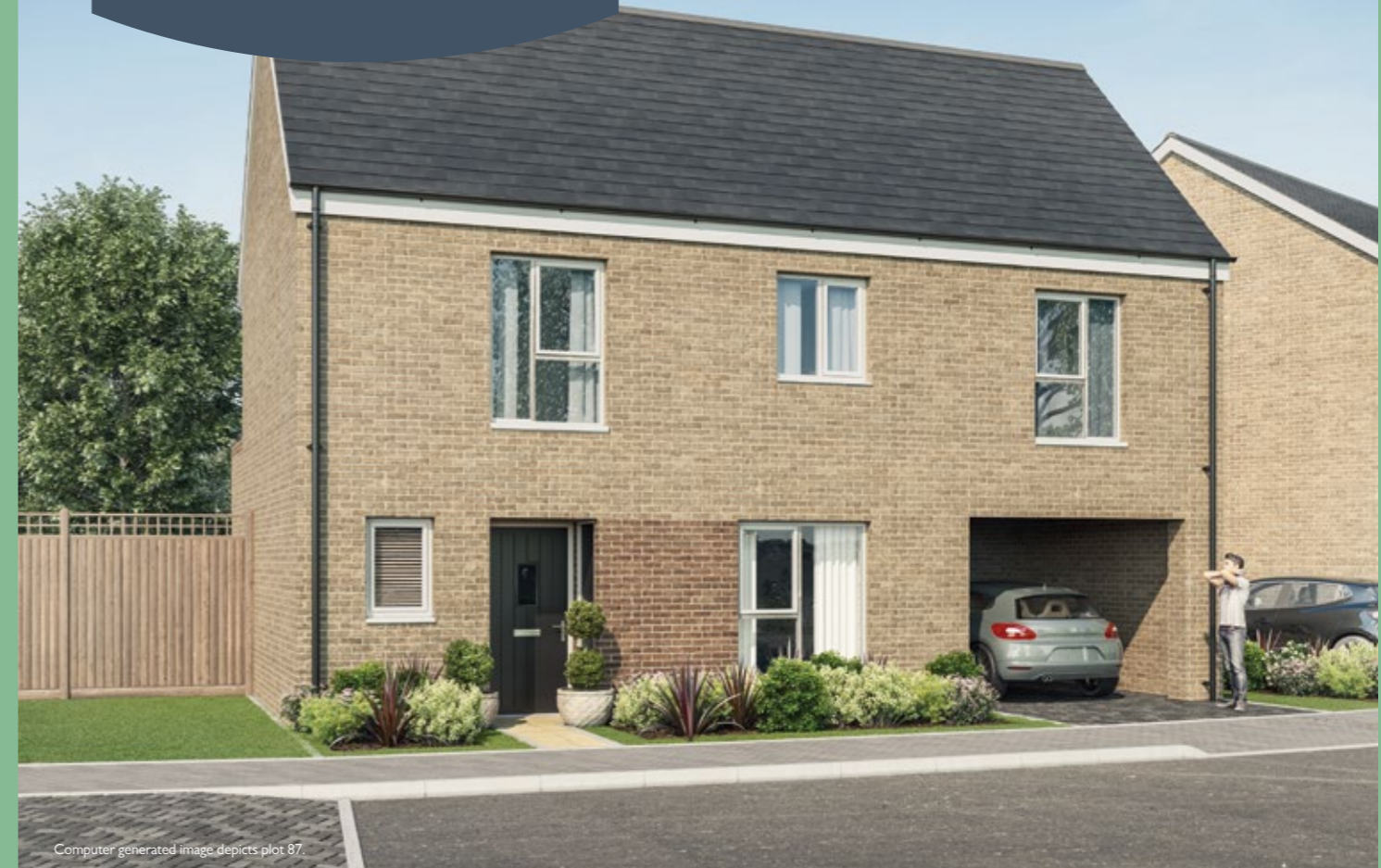
Computer generated image depicts plot 87.